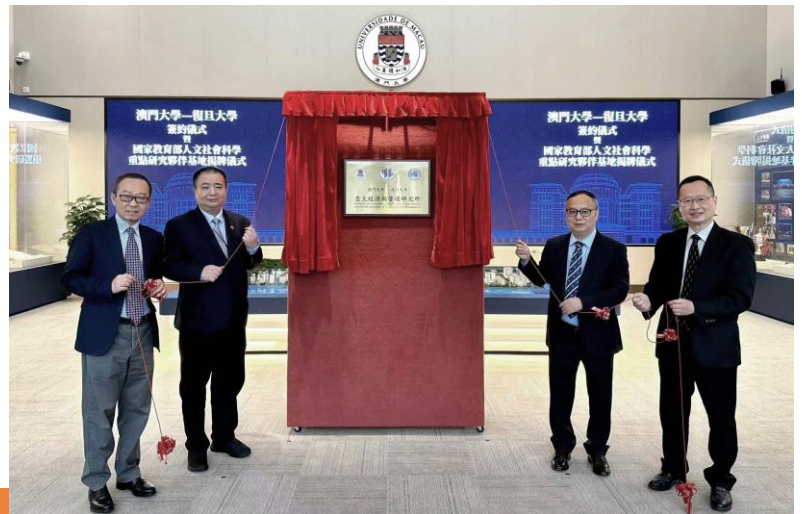
Pictures: The strategic cooperation initiatives signing and plaque unveiling ceremony.