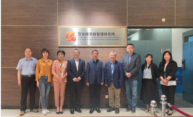
Picture: The delegation from Zhejiang University visited APAEM.