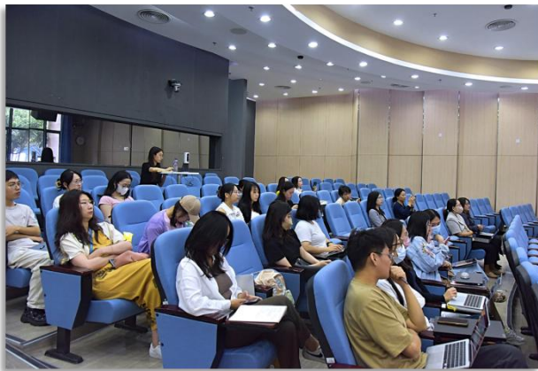
Picture: Participants paid attention to the speaker’s presentation