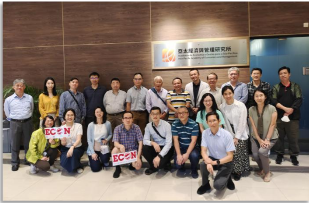
Picture: the delegation of the Department of Economics of LU visited APAEM

Besides events, APAEM welcomed a delegation of the Department of Economics of Lingnan University on 20 June 2023, to discuss the potential academic collaborations under the Guangdong-Hong Kong-Macao University Alliance for Economics.