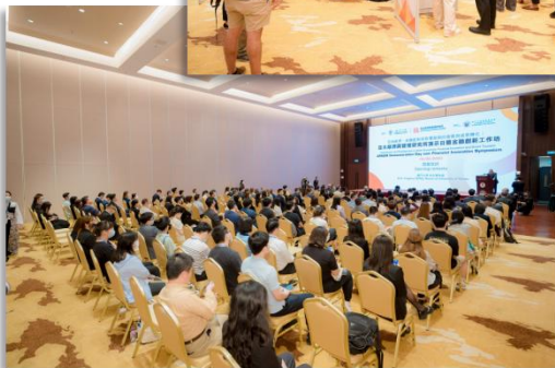
Pictures: The APAEM Demonstration Day cum Financial Innovation Symposium

By showcasing APAEM's major achievements, the event provided a platform for the government, industry, and academia to engage in in-depth exchanges and foster cooperation, created an opportunity to promote industry-academia communication and collaboration, as well as serving as a learning and sharing platform for those who are interested.